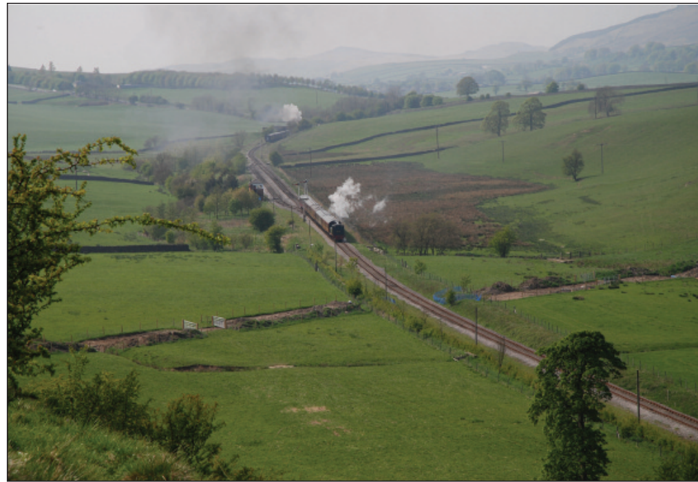
Stoneacre Loop is just about the half-way point between Embsay and Bolton Abbey. This was the eastern end of the line between 1992 and 1997 and is now used as a passing loop when two trains are running.