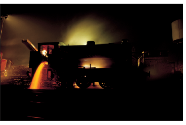
Backlighting from the coal dock lamp has produced a dramatic silhouette and the time exposure has recorded the throwing out of the embers as a cascade of fire.