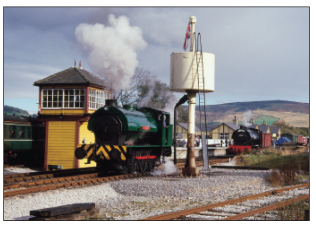
The signal box at Bolton Abbey is a Midland Railway 'box brought in from Guiseley and the water tower came from Skipton Station.