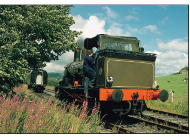
Having deposited its coaches in the loop, 'Bellerophon' prepares to run round the train in readiness for the return journey.