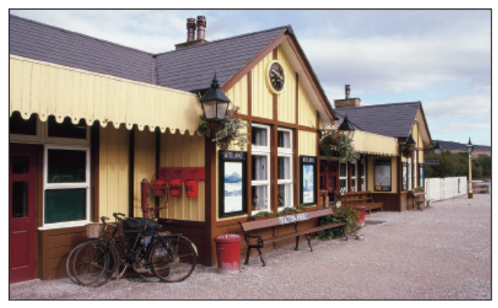
A completely new station was built, to a Midland Railway design, replacing the original derelict timber building which had to be removed due to its dangerous state.